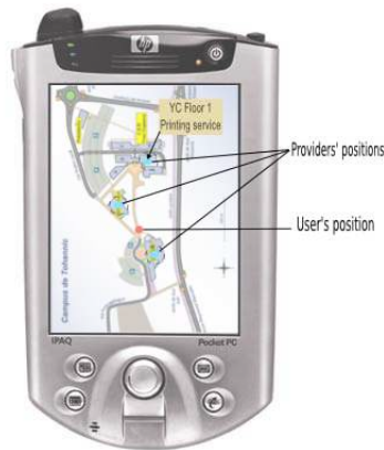
Fig. 2. A service location application developed using our framework and running on an IPAQ