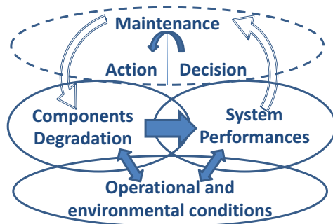
Fig. 1. Relationships and concepts representing domains of dysfunctional causality (DDC)

System prognostic model deals with generic concepts influencing system performances. These concepts define different domains of the dysfunctional causality (DDC). The dysfunctional causality explains the causal relationships between primary causes and final effect (figure 1).