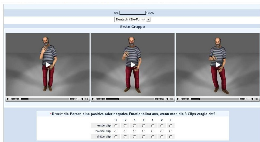
Fig. 2. Screenshot of a form that had to be filled out by a subject

3 styled realizations of a gesture clip. The video embedded in the questionnaire depicted short clips (mostly phrase segments) of motion captured weather forecast sequences (5 clips \times 3 styles: M-W-n , M-W-a , M-W-w ) and train information sequences (4 clips \times 3 styles, 1 captured style: M-T-n and two generated styles: M-T-a , M-T-w ) as depicted in section 3. 27 clips have been generated in total. All clips have been rendered in the same manner: agent appearance, lighting conditions, camera position and orientation were the same for each gesture clip. Rendering of our generated motion files was performed in Blender's 1 internal rendering engine. A questionnaire is depicted in Figure 4.1.