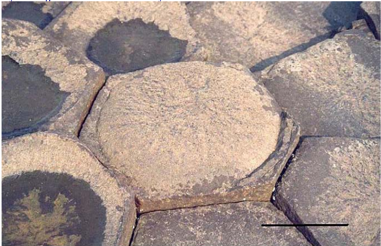
Figure 4: Basalt prism section showing a radiating structure limited by a circle. The circle is itself inscribed within the polygonal section. Giant's Causeway, Ireland. Diameter of the prism of about 60 cm (scale bar length: approx. 25 cm).