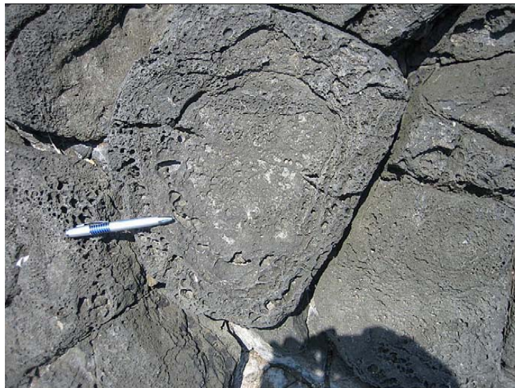
Figure 3: Basalt prism section showing a cylindrical distribution of gas bubbles. Cap Nègre, near Sanary sur mer, Var, France.

Before one gets further quantitative data on the thermodynamics, kinetics and mechanics of complex silicate systems (including solid, liquid and glass and various proportions of volatiles) as just discussed, let us remain more qualitative, and let us stress the following: if one takes the constitutional supercooling hypothesis for granted, some circular structures within the cells are to be expected; they reveal heterogeneities of the solid mass before its possible thermal contraction, and are related to degassing. These heterogeneities are rare; in order to be registered in the solid, they must freeze a rapid change in the composition and the properties of the magma around the finger that did not have time to be erased by diffusion within the liquid. In the past twenty years, I have sought such heterogeneities and have found many. I give some examples here without discussing the details of the mechanisms involved for each.