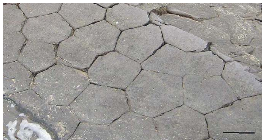
Figure 2: Geometry of fractures and joints in a lower colonnade. Aubrac, France. According to our analysis, this type of network is due to supercooling fingering (see text). The size of the polygons is 40–50 cm (scale bar length: approx. 30 cm).