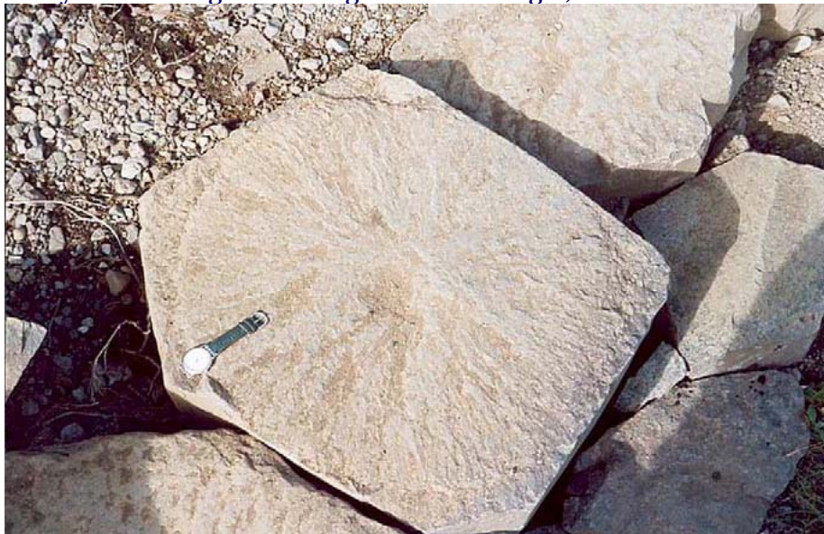
Figure 5: Basalt prism section showing a radiating structure limited by a circle. The circle is itself inscribed within the polygonal section. Skaftafell Park, Iceland.