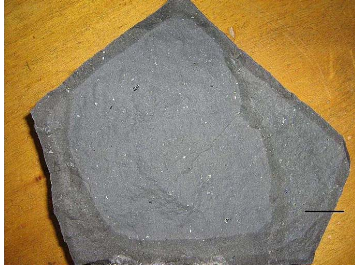
Figure 8: Black ring inscribed within one basalt section and intersected by the contours of the prism. Saint-Arcons d'Allier, Haute-Loire, France, (scale bar length: approx. 5 cm).

development of fingers and the early preferential orientation of the solid grains as imposed by the fingers and to texture changes in parallel to gas content changes. This reinforces the previous results.