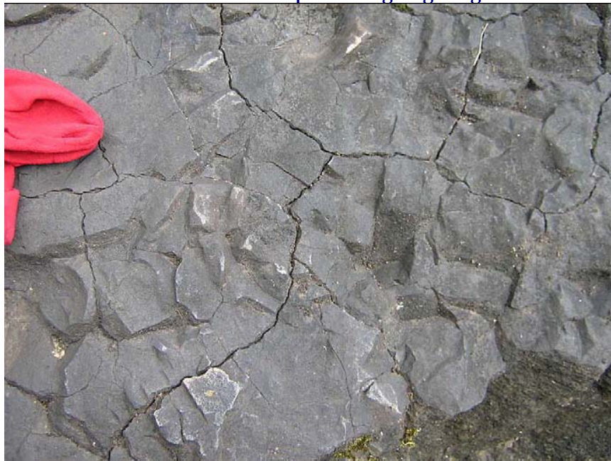
Figure 1: Geometry of fractures and joints in an entablature. Saint-Arcons, Haute-Loire, France. The size of the polygons varies from 10 to 20 cm. According to our analysis, this type of network is due to thermal contraction (see text).

joint/crack networks, their occurrences and relationships. In the literature on the subject, some authors recognize that networks due to contraction are actually different from those commonly observed in basalt columns, but argue that they just appear at the surface and can become more regular at depth and become similar to those of the latter. Theoretical models are proposed (see e.g. Saliba and Jagla, 2003). These works deserve thorough attention, but do not appear to me as supporting the contraction hypothesis, since the chosen geometry of the starting point itself does not match with this hypothesis; and because the model predicts an equilibration of the dimensions of the polygons at depth and not the appearance of new angles between the joints, that would be needed to shift from one system to the other. Experimental work on drying starch, although it actually shows an ordering of fracture networks in depth, does not lead to a hexagonal-type geometry strictly similar to that of the rocks (see e.g. Toramaru and Matsumoto, 2004). When one speaks of a transition between one system to the other on the field, this is likely to be merely a juxtaposition between a thermal contraction network outside and a supercooling fingering network inside the flow.