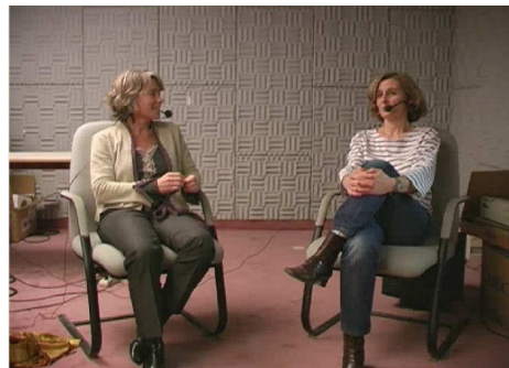
Figure 1: The CID French spontaneous conversation corpus.

several nonverbal modalities such as gesture, gaze and posture. The speech and linguistic aspects are beyond the scope of this paper (Bertrand et al., 2008). After specifying a coding scheme for gesture, postures and gaze (sections 2-4), we measure the inter-coder agreement between three independent coders on a subpart of the annotations (section 5.1). Finally, we study the relations between posture and gesture (section 5.2).