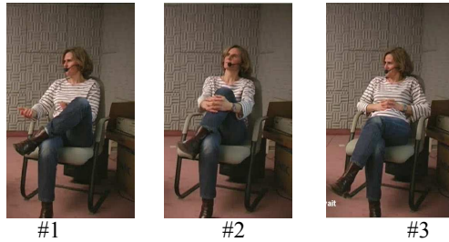
Figure 2: Illustrations of three typical postures occurring during the first 15 minutes of conversation for one speaker.

Three whole body posture types have been found for one of the speakers during the first 15 minutes of the recording. In Figure 2 we selected three representative frames to illustrate the most common postures. Over 89 extracted postures, type #1 represents 44% of the postures, type #2 represents 32.5%, and type #3 represents 15.7%. Posture type #2 occurs mostly at the opening of a turn by the speaker, while posture #1 occurs at the closing sequence; posture #3 occurs mostly in the continuing sequence for the listener.