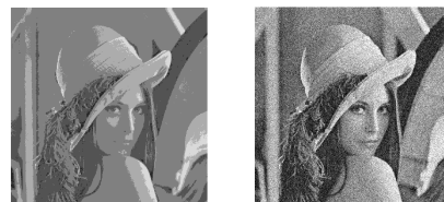
Reconstruction quality with a non-dithered (left) and a dithered (right) bioinspired quantizer.