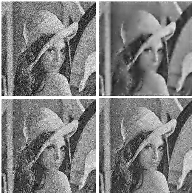
Fig. 4. Robustness to noise: qualitative comparison between our new codec, JPEG, and JPEG2000 under the same rate restriction (here 0.27 bpp). Upper left: Lena with additive Gaussian noise ( mean = 0 , variance = 0.05 for a normalized image dynamic range). Upper right: coded/decoded image using the new codec. Lower left: coded/decoded image using JPEG. Lower right: coded/decoded image using JPEG2000.

We have proposed a new bio-inspired codec for static images. First, the image is converted into a ROC code via a simplified retinal model, then a stack run coder is applied, followed by a first order arithmetic compressor.