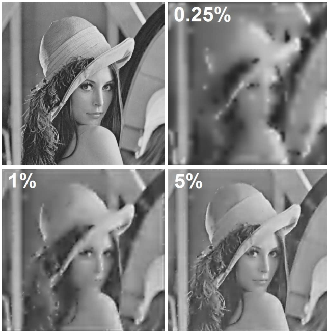
Fig. 2. Progressive image reconstruction of Lena using Thorpe ROC coder with a scaling function. Upper left: Lena. Upper right and lower: The coded/decoded image reconstruction with an increasing percentage of spikes decoded.