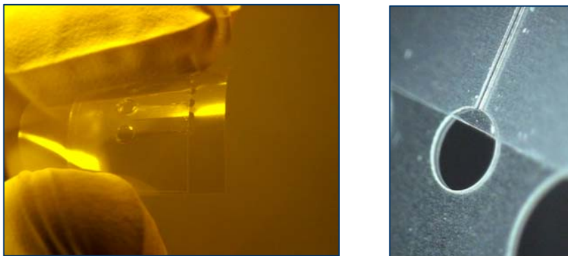
Fig. 2: Flexible microfluidic passive device composed of two polyester foils, one foil with through-holes structured by femtosecond laser ablation and a cover foil laminated on top of the previous one and bonded with epoxy dry SU8 resist: a) photograph of the laminated assembly; b) SEM close-up picture of the bonded foils.

The 20 \mu\text{m} thick SU8 photoresist acts as an adhesive layer that flows and ensures an easy joining of both polyester foils. The final device is composed of two polyester foils bonded together, one with the patterned microfluidic circuit and one cover foil (Fig. 2). The bonded composite foils are flat and do not show visible distortion at the macroscale, indicating low bow / warp and stress level in the final assembly. They also kept their optical transparency. However we can note that the adherence of the two polyester foils bonded using SU8 is not very strong as we used the protection layer of the SU8 commercial dry films which may have been treated for not sticking to the epoxy film, therefore modifying its surface properties. Other readily available polymer sheets will also be investigated as structural materials in future work.