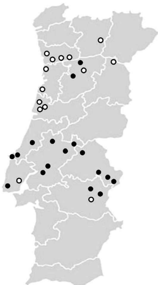
Fig. 3 Map of Portugal showing the known geographical origin of the families with the c.156_157insAlu BRCA2 germline mutation. The open circles indicate the origin of the 14 families here reported and the black circles the families previously described by Machado et al. [16]

sixth being the c.156_157insAlu BRCA2 mutation [16]), our mutation detection rate would have been 41%. Although this mutation rate can be seen as relatively high, it also indicates that other BRCA1/BRCA2 mutations undetectable by current-day screening methodologies may remain to be uncovered in high-risk breast/ovarian cancer families. On the other hand, five out of the 30 pathogenic mutations would have been missed had we used the generally recommended higher than 10% mutation probability criteria for genetic testing (8 of 30 if >25%). Careful selection of families after genetic counseling is therefore recommended to increase the chance of identifying all families that can benefit from genetic diagnosis of inherited predisposition to breast/ovarian cancer.