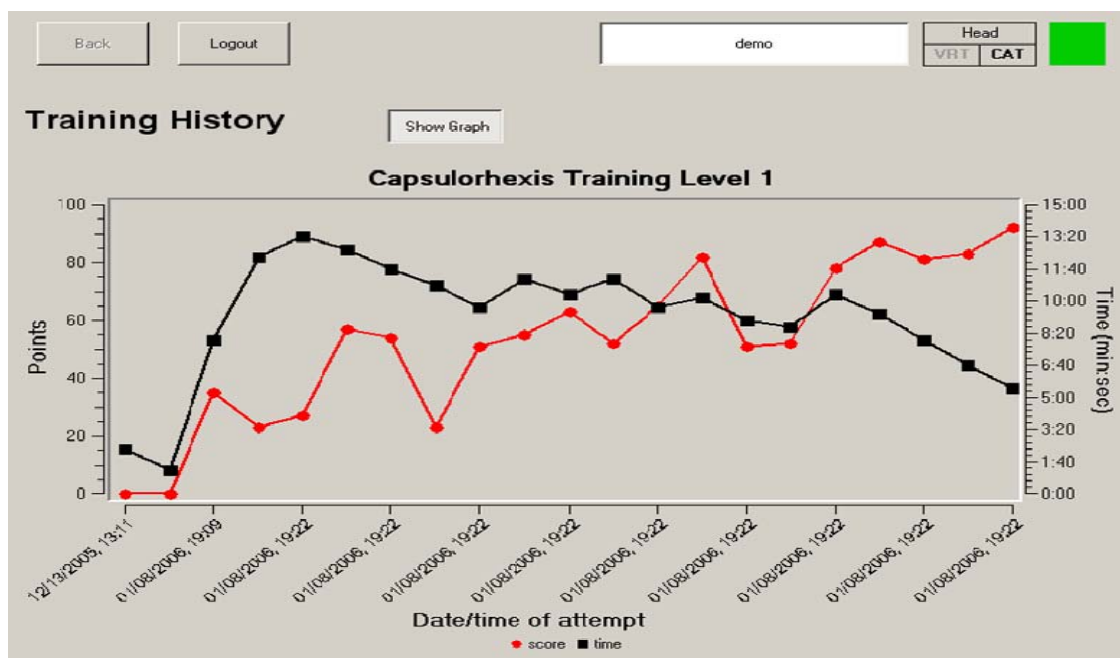
Fig 1- A: The EYESI virtual reality ophthalmosurgical simulator B: Display screen C: Training history graph.