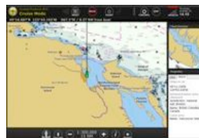
Figure 3. Coastal Explorer