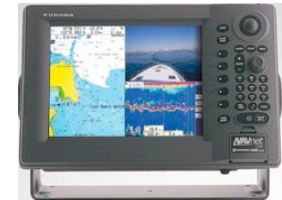
Figure 4. Furuno

These environments enable navigation to be greatly improved by only showing the necessary information, eg. by combining satellites photos of the earth and nautical charts like PhotoFusion in Figure 5 proposed by MaxSea [14].