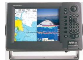
Figure 4. Furuno

These environments enable navigation to be greatly improved by only showing the necessary information, eg. by combining satellites photos of the earth and nautical charts like PhotoFusion in Figure 5 proposed by MaxSea [14].