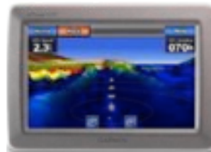
Figure 1. Garmin

These aims have led maritime software publishers to develop increasingly sophisticated platforms, offering very rich virtual environments and real time information updates. There are many companies on the embedded maritime navigation software market. They can be separated into two categories. The first part includes those, which develop applications enabling embedded sensors to be taken advantage of (radar, depth-finder, GPS, etc.), such as Rose Point [4], publisher of Coastal Explorer software (Figure 3) and MaxSea International [14], publisher of the MaxSea TimeZero software (Figure 2). Other companies offer hardware platforms in addition to their software applications, like Furuno [10] (Figure 4) and Garmin [11] (Figure 1).