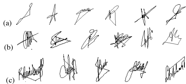
Fig. 1. Examples of signatures from DS2 of (a) highest, (b) medium and (c) lowest Client-Entropy measure

We performed on the two BioSecure Subsets DS2 and DS3 containing the same 382 persons, a K -Means on the Client- Entropy measure values for different values of K and reached a good separation of signatures with K=3 as shown in Fig 1 and Fig 2, respectively on DS2 and DS3.