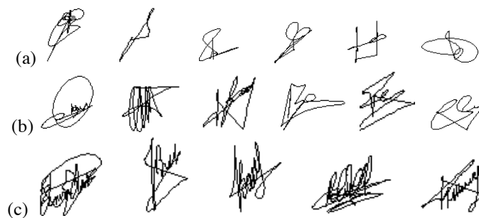
Fig. 2. Examples of signatures from DS3 of (a) highest, (b) medium and (c) lowest Client-Entropy measure

We notice visually that on the two Subsets of DS2 and DS3, the first category of signatures, those having the highest Client-Entropy measure, contains short, simply drawn and not legible signatures, often with the shape of a simple flourish. At the opposite, signatures in the third category, those of lowest Client-Entropy measure, are the longest and their appearance is rather that of handwriting, some are even legible. In between, we notice that signatures with medium Client-Entropy measure (second category) are longer and sometimes become legible, often showing the aspect of a complex flourish.