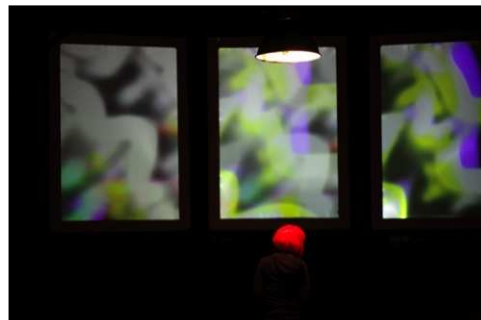
Figure 3. Second part of "Il était Xn fois", 3 interactive screens.

Of course, one goal is to overcome the technological aspect. Whether it be "forgotten" for the benefit of the theatrical and emotional aspect. Here again this point is in touch with the need of presence during interactions, object of concern for researchers in virtual reality. Here, the artists highlight this concept by indicating that it corresponds to a forgotten of technic. It is worth to notice the emphasis of emotional dimension and the suggestion that forgetting is not necessarily synonymous with realism. In this regard, a good book can account for emotional credibility. With the technology of virtual reality, the technical complexity is added to the emotional rendering.