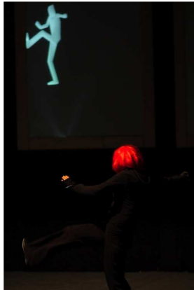
Figure 4. Actress in motion capture suit and her avatar.

Technically, the cameras capture the bursts of light pens, which allows the drawing of shapes on large screens (Figure 3), sensors allow actresses to trigger sounds, varying the speed or intensity of these sounds. A central element of particular concern to working with virtual reality specialists, is to use a jumpsuit of motion capture allowing embodied interaction between an actress and her "double", projected on screens (Figure 4). It is here that the technical collaboration has taken place. One recognizes the concern of enactive embodied cognition. The importance of the body in search of meaning.