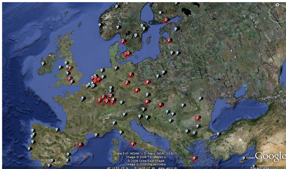
Figure 1 indicates those institutions that have indicated an interest to act as CLARIN centres.

Most of the above-mentioned criteria apply to typical centres offering resources. However, similar requirements can be established for centres offering language technology services such as those based on, for example, Natural Language Processing or Automatic Speech Recognition components. An important difference is that service centres will have to face the potentially growing interest of the future users. This issue is even more important as users from across the Humanities and Social Sciences disciplines often do not have access to computing resources and do not have enough technical skills to configure and use language tools on their own computers. Thus, service centres should guarantee an appropriate level of computing power to serve such users. For some tasks, e.g. shallow statistical semantic analyses of language in large corpora the needs for processing power can be substantial even in the case of one user performing an analysis, not to mention many users working simultaneously. This issue brings in organisational and technical aspects similar to those well known in the domain of computing centres in e.g. chemistry and physics, but it is still very seldomly discussed in the context of language technology infrastructure. Recently, a large European initiative called PARADE [21] was presented that will tackle these issues by creating a horizontal data services e-Infrastructure.