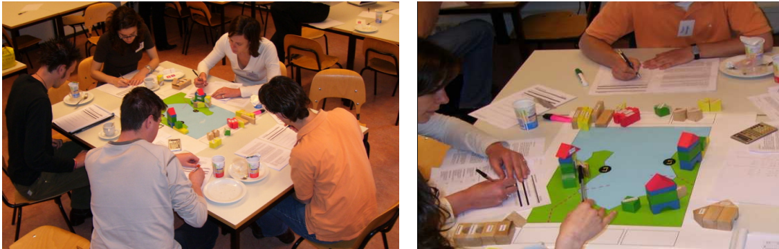
Figure 3. Testing the game with graduate students

Two test runs of the game were conducted prior to using it in an actual course. In the first test run, the roles were played by university staff and the plot was limited to the first round only. This test was meant to check whether the purpose of the game was achieved and focused especially on the do-ability of the game. The second test run was conducted with graduate students (see Figure 3) and included both rounds.