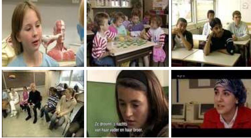
Figure 2: Classroom concept: some frames with faces.