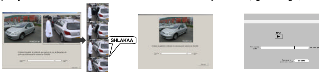
Fig. 2. Interfaces of experiment 1: Sounds with video (left), Pictures without sound (middle), Sounds without picture (right)