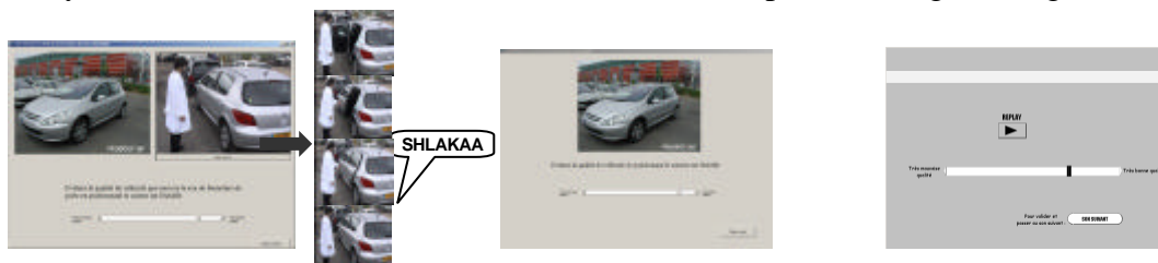
Fig. 2. Interfaces of experiment 1: Sounds with video (left), Pictures without sound (middle), Sounds without picture (right)