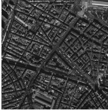
Figure 2: Satellite urban image provided by the french spatial agency, CNES. The resolution of this image is 50cm. Impact of compression and subsampling in disparity accuracy for this image are displayed in table 2.