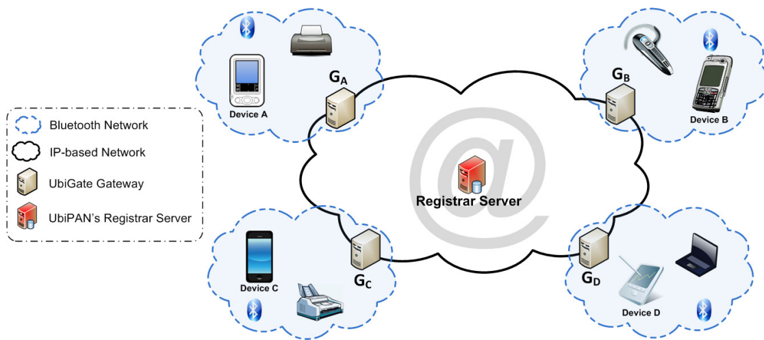
Figure 1. Overall architecture of UbiPAN

Area Networks by combining the use of wired and wireless communication technologies. We rely on the use of the IP network, the SIP [4] protocol and Bluetooth.