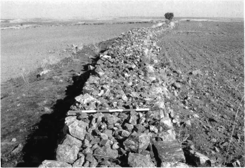
Fig. 31. El Pedrosillo (Casas de Reina). Wall from the major camp (J. G. Gorges & G. Rodríguez Martín).

The complementary defensive systems and annexed constructions. To the north of the main camping, to both part of the stream, the Roman strategists developed a complementary system of defense very elaborated, which turns to the complex of the Pedrosillo like one of more excellent the conserved catrastrales sets of Hispania . There are active defensive systems, like circular bunkers or redoubts ( castella ), or passive obstacles, as lines of stones ( titula ), or facilities that has taken advantage of natural pits formed by the bed the stream, that the own Romans have deepened.