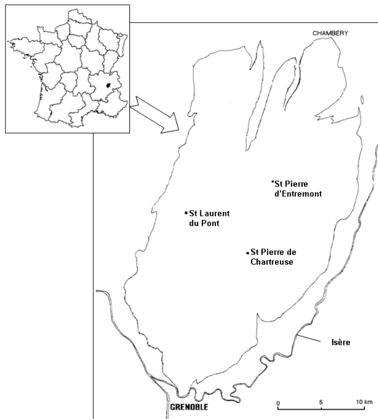
Figure 1. Location of the study area: le massif de la Chartreuse (France).

limited economic interest, their role in preventing soil erosion and their protected status in Europe, these habitats have remained basically unmanaged and are likely to be close to their natural state. This is particularly true in the Chartreuse, where history and topographic conditions favoured their conservation. However, sycamore habitats sometimes are damaged during harvesting of other more commercial species due to their position in ravines.