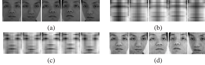
Figure 1. (a) Original images (Asian Face Database PF01). (b) Corresponding reconstructed images with k = 2 2DO-DCs. (c) With k = 3 . (d) With k = 20 . The projection space is constructed from the training set of the first experiment (see section 3). With the third 2DO-DC the facial features (eye, nose, mouth) appear, but the head poses are not distinguishable yet. With more 2DO-DCs a good visual quality of reconstruction is obtained.