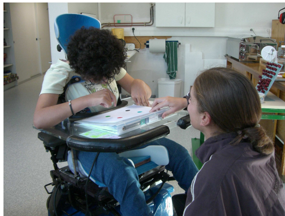
Figure 3 – Student and child during the task B.5

To illustrate this issue, the task B.5 is detailed here. Following the UCD model, in order to specify the user and organizational requirements, the students had to specify the use case into the children situation. Since the child was very hard to be consulted, especially because the disability, the students needed to find a way to specify his capability. They designed a setup to measure his hand movement capacity and limits. A scenario has been created for his potential movement, and then a setup test was prepared for the measurement. As shown in the figure 3, a student asked the child to touch the colored paper to find out first his accuracy ability (size of button), and second for his distant access (maximum dimension of playing zone). This so called “setup test procedure” was recorded for the further analysis. However, there were some time limits for child consulting.