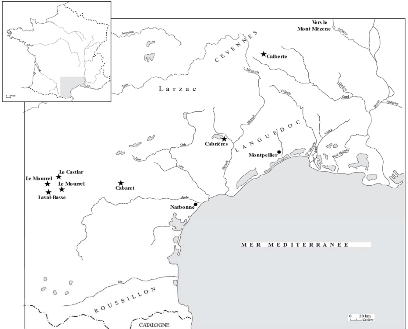
Fig 1 Location of sites in Languedoc