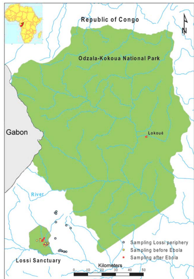
Figure 1. Map of the studied populations. The locations of the samples collected before and after Ebola outbreaks are showed. doi:10.1371/journal.pone.0008375.g001

We investigated the short term effects of Ebola outbreaks on genetic diversity and structure of the Western lowland gorilla population in the Odzala-Kokoua National Park and in the Lossi Sanctuary (Republic of the Congo, Figure 1). Thanks to the long term monitoring of these populations, faecal samples were collected from wild gorillas before and 2 to 4 years after Ebola outbreaks and at the periphery of the sanctuary where Ebola has not been detected. 177 different individuals were genetically identified using 17 microsatellite loci. Due to the short time span between sampling events, genetic diversity is expected to be similar in pre and post-epidemic samples assuming that there is no bias in the sampling or in mortality due to Ebola and that social organisation and migration fluxes were not perturbed by the outbreaks. In order to test these hypotheses, we examined temporal changes in genetic diversity and structure in pre and post-epidemic populations. Given that gorilla share Ebola virus with humans and that viability of gorilla is threatened by this disease [2,51], understanding the influence of infectious diseases on gorilla genetic dynamics is of paramount importance for human health, evolution and conservation biology sciences.