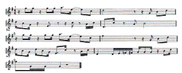
Figure 2. Melody B2