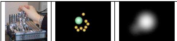
Figure 5. Pebble Box 2: “Changing the matter & the visualization” & VR Haptic manipulation

The Pebble box 3 is a 2D Virtual Pebble Box composed of a circular box containing 8 mobile masses more or less rigid, in interaction of collisions more or less visco-elastic and with 1 more or less rigid mass (the manipulator) controlled by the ERGOS haptic high quality device.