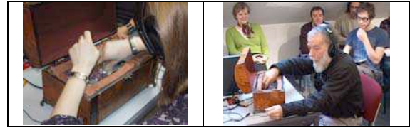
Figure 2. Left : "Pebble Box 1" Right : An experiment: "surprising but believable";

sounds), subjects are likely surprised, but « nicely surprised » (See photograph in Figure 2. The situation did not seem to them completely impossible. They modify their manipulation and their interpretation to make as best as possible the situation believable.