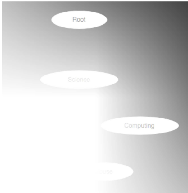
Figure 1. The word “mouse” found in the text matches the word “mouse” in the terminology generating a graph.