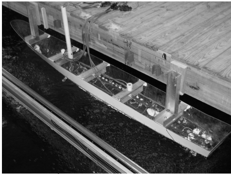
Fig. 1. 1/40 th mock-up set in measurement conditions

To check the diagnosis method explained before, real measurements are employed: a composite 1/40 th mock-up of a frigate has been equipped with an adapted ICCP, electrically linked to iron plates (simulating the paint defects) disposed on the hull. The mock-up is then placed in a salted water with a controlled conductivity (5,16 S/m).