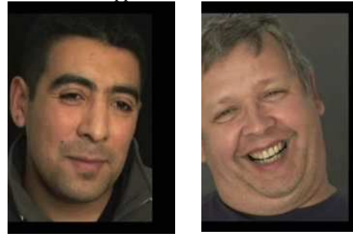
Figure 3: Still pictures of speakers showing cold anger (left) and happiness (right).