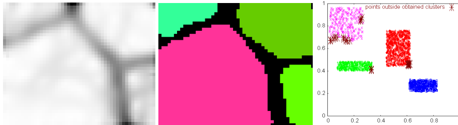
Figure 2: Visualization of the typical "mean distance to neighbors" matrix for the SOM obtained on the 2D data set of fig.1 (left). Corresponding segmentation of the SOM produced by our algorithm (middle). Clustering result (right): no points are affected to the wrong cluster, and only a few "border" points end up unclassified (big stars).

For the SOM algorithm, we used a gaussian kernel neighborhood and a linearly decreasing learning rate. After the algorithm has converged, we compute the U-matrix of the map, and visualize the "mean distance to neighbors" as defined in §2 (see left of figures 2 and 3). Then we apply our region-growing algorithm separately to each visually-identified cluster, using for each of them a different threshold chosen as the maximum possible value that does not induce a propagation to other clusters. We thus obtain a segmentation of the map, where each region is separated from the others by some "no man's land" (or "frontier") units (see figures 2 and 3).