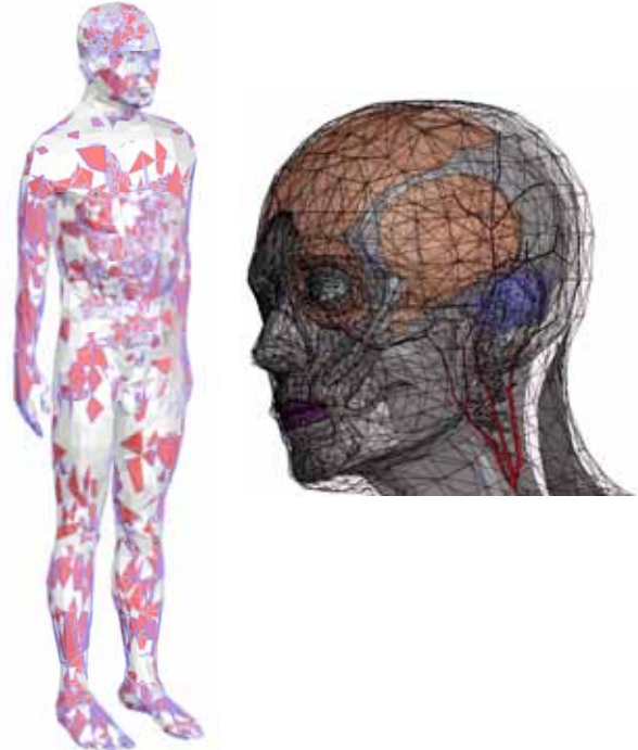
Fig. 3. Left: the computational phantom; the elements eliminated for post-processing are rendered in red. Right: details of the 2mm resolution phantom.

codes Gefem++ ( \phi -A formulation) and Carmel (A-V and T- \omega formulations). It is found that there is a rather good agreement for some organs, mainly those with a low conductivity. But there are also great discrepancies on other organs, mainly those with high conductivity, notably the eyes. On these organs, the filtering with a geometrical criterion has no effect as the three corrected methods differ. Conversely, the effect of filtering is important on muscle.