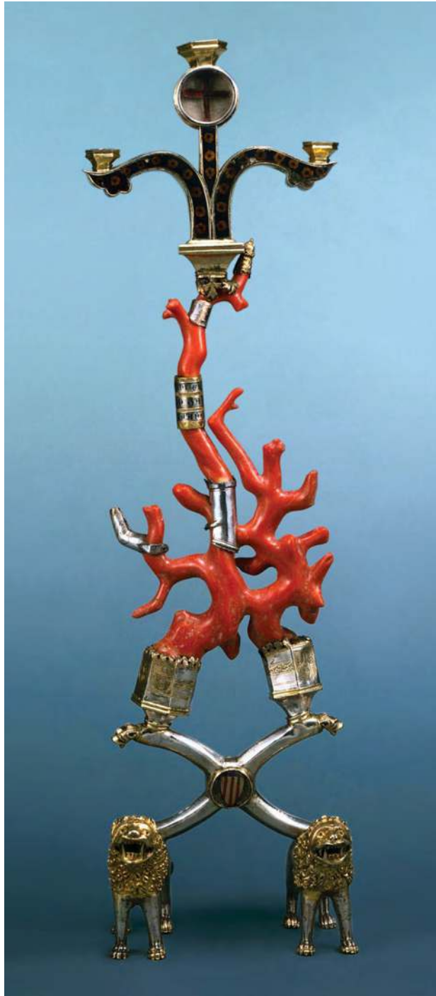
Figure 2. This early 15th century Portuguese reliquary holding a fragment of the Holy Cross features red Corallium coral. The piece measures 53.2 cm tall and 20.0 cm wide. Courtesy of Museu Nacional de Machado de Castro, Coimbra, Portugal; collection no. MNMC 6036, © DDF/IMC.

market today are from the Corallium genus, including the prized “ox-blood” (dark red; figure 2) and “angel-skin” (light pink; figure 3) colors.