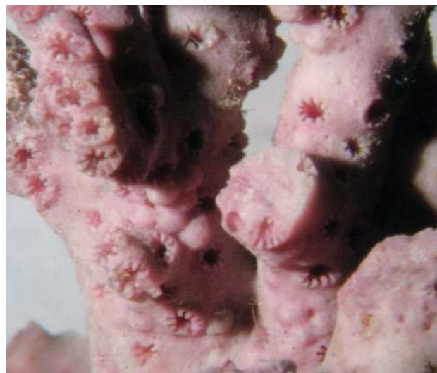
Figure 4. Corals of the Stylasteridae family, such as this pink specimen of the species Stylaster roseus (sample no. 1; other portions of this same specimen were red) are protected by CITES. Note the distinctive surface pores of this “lace” coral. image width 9 cm.

gemological methods, the present study explores their identification based on Raman scattering analysis.