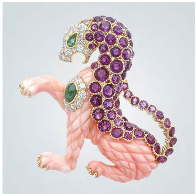
Figure 3. The pink Corallium coral in this 6-cm-tall clip is set with emerald, amethyst, and diamond.

The specific gravity of coral ranges from 2.37 to 2.75, and it is strongly dependent on the porosity of the individual piece. The refractive indices of both calcitic and aragonitic corals are a function of their calcium carbonate configuration. RI is also influenced by the magnesium content of calcitic corals and the strontium content of aragonitic corals (Rolandi et al., 2005). Because corals from these two genera can be difficult to separate using only classical