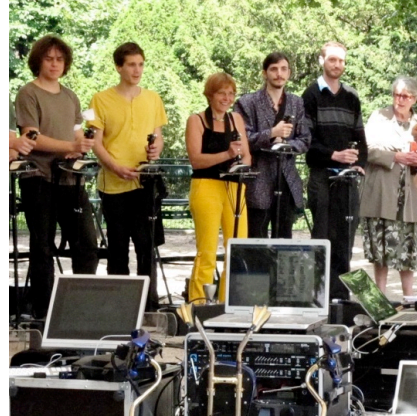
Figure 3. the Meta-Orchestra playing Meta-Mallette

10 users of these devices (creators, developers, composers and/or performers, researchers, teachers, pupils from conservatoire) 29 have been interviewed using semi-directive methodology. Subjects were asked non-directive questions (ex: in your opinion what is Meta-Instrument? how do you characterise it? 30 ), going from the more general to the more specific thematic 31 . At the end of interviews they were also asked to answer to an open questionnaire concerning some words: sound ( son ), visual form ( forme visuelle ), gesture ( geste ) and instrument (ex: could you give 5 examples of instrument? In your opinion what is an instrument? 32 )