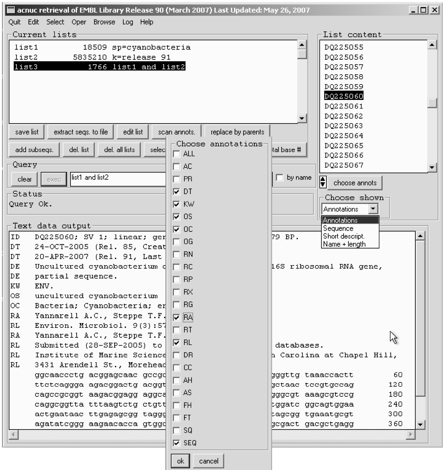
Fig. 4 - Gouy