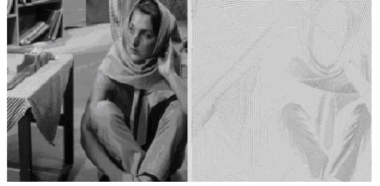
Fig. 3. The representation result in last iteration of proposed algorithm for the Barbara image. (left) Output of curvelet transform with six resolution levels which corresponds to \mathbf{A}\mathbf{s}_1^{opt} . (right) Output of local-DCT representation with a block size 32 \times 32 which corresponds to \mathbf{B}\mathbf{s}_2^{opt} .

In Fig. 3, (Top left) we show the original Barbara image, on top right the target regions are masked in white. Region