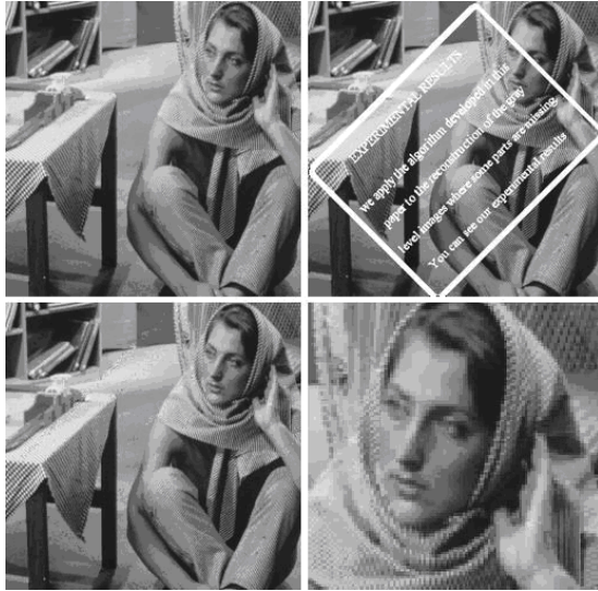
Fig. 4. The reconstruction of the masked image. (Top left) Original image. (Top right) The target regions are masked in white. (Bottom left) Region filling via the proposed inpainting algorithm. (Bottom right) The result of our algorithm around Barbara's eyes.

ing”, Proceedings of the SPIE , vol 3391, pp. 75-86, 1998.