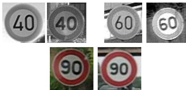
Figure 3. Illustration of the variability of global aspect of the same speed-limit sign digits, both across different E.U. countries and even inside a given country: on top German signs (left of each pair) compared to their French equivalent, and on bottom two variants of the French 90 speed-limit sign.

This design choice (using digit extraction and recognition instead of global sign recognition) proves to be an advantage also in Europe, where there are actually some differences in global aspect of the same sign among different countries, and even inside a single country such as France for instance (see figure 3). Even though we presently train a specific neural network for speed sign digits recognition (see below), a final pan-European system could probably work with a “universal” digit recognition module, therefore not requiring the previous collect of all European variants of each sign.