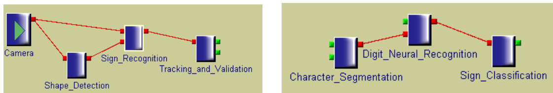
Figure 1: Global modular architecture (left) and detail of the Sign_Recognition block for the E.U. case (right).

The modularity of our system allows to easily adapt it to different types of speed-limit signs (e.g. U.S. vs E.U. speed-limit signs), or even detection of other kind of traffic sign.