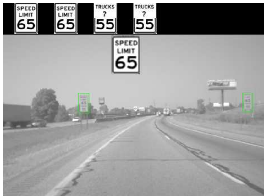
Figure 6: Detection and recognition of another variant of U.S. speed limit sign, with exactly the same system.

A more thorough evaluation has been done for the E.U. system, using ~150 minutes of recordings on French roads and streets, under various daytime illumination conditions, and