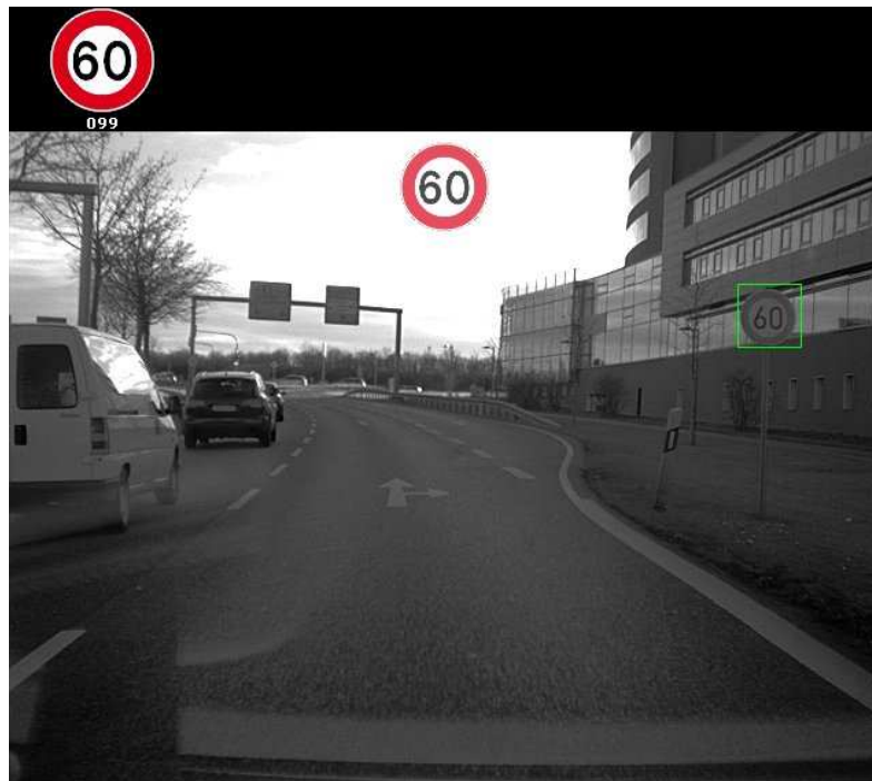
Figure 8. Correct recognition of a German speed-limit sign illustrating promising results for pan-European speed-limit recognition.

The above results were quantified only on French videos, but evaluations in other E.U. countries are currently under way, with very promising results (see figure 8 with an example in Germany).