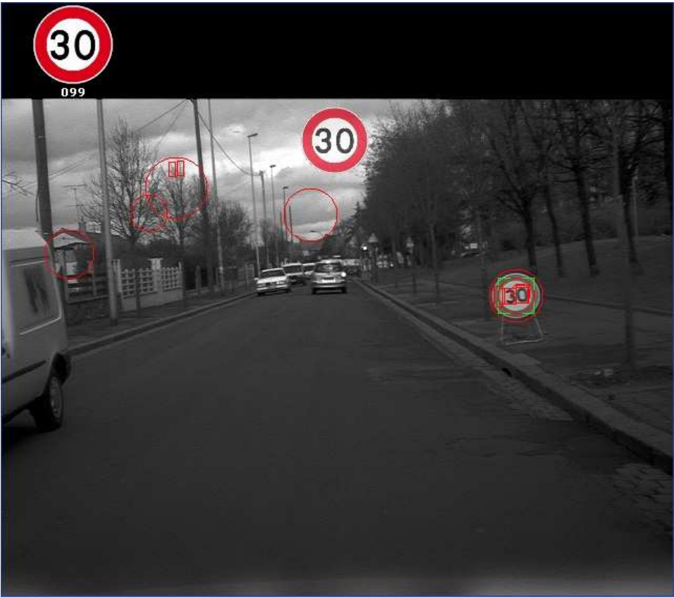
Figure 7: Speed limit sign detection on E.U. street; this example also illustrates the interest of visual detection the case of temporary roadwork

Most of the 11% non-correct-detections are just missed signs (sometimes because of not contrasted enough edges of the sign, and most of the time because of noise or occlusion impeding digit segmentation). The misclassification rate (signs for which a wrong speed value has been validated) is below 1%. And, most importantly, not a single validated false alarm has been noticed in the 150 minutes of daytime recording: all spurious signs are efficiently filtered by our tracking and validation module. Note that these 150 minutes of analyzed recording are not consecutive, but selected around moments when speed limit signs are visible, and cover various illumination conditions and types of roads and environment. Also, several experimental real-time on-road tests aboard an experimental car have been conducted, for a total of many driving hours, and were quite satisfactory.