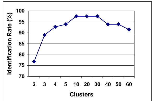
Figure 2. Graph of Identification Rate against Number of Clusters

It is hypothesized that different alphabets require different number of prototypes to effectively model all the possible writing styles of that character. For example, there are more ways and styles to write the alphabet ‘f’ than to write the alphabet ‘c’. A preliminary level of analysis has been performed to find a global optimal value for the number of prototypes needed.