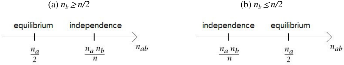
Figure 2. Two possible cases for equilibrium and independence.

Let M_{idp} and M_{eq} be two RIMs which measure the deviations from independence and equilibrium respectively. The fixed values at independence and equilibrium are noted v_{idp} and v_{eq} :