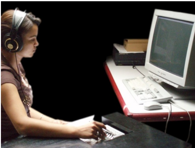
Figure 1: Expo Nano virtual nanomanipulator: anybody with no pre-requisite knowledge can explore and discover details of object interactions at nanoscale.

The rule was that no previous knowledge was required [8]. Only helped by real time human perception, everybody should discover and explore a central aspect of the nanoworld within a few minutes. This time scale is imposed by two constrains. First there is a practical constrain. During a public exposition, it is hardly possible to propose a face to face module that must be used a longer time than few minutes to obtain a result. Second a longer time would lead to a much more complex presentation that would not be suited for a general audience. A short time of use means that pedagogical strategy is based on a discovery process more than on a gradual understanding. The needed duration of manipulation is certainly an important aspect in building these applications and it certainly deserves a deeper scientific and careful analysis. Such a system that must be used a longer time with much larger ambitions is now used by more advanced students in science. In that case, students use it during approximately two hours with much more sophisticated strategies and objectives.