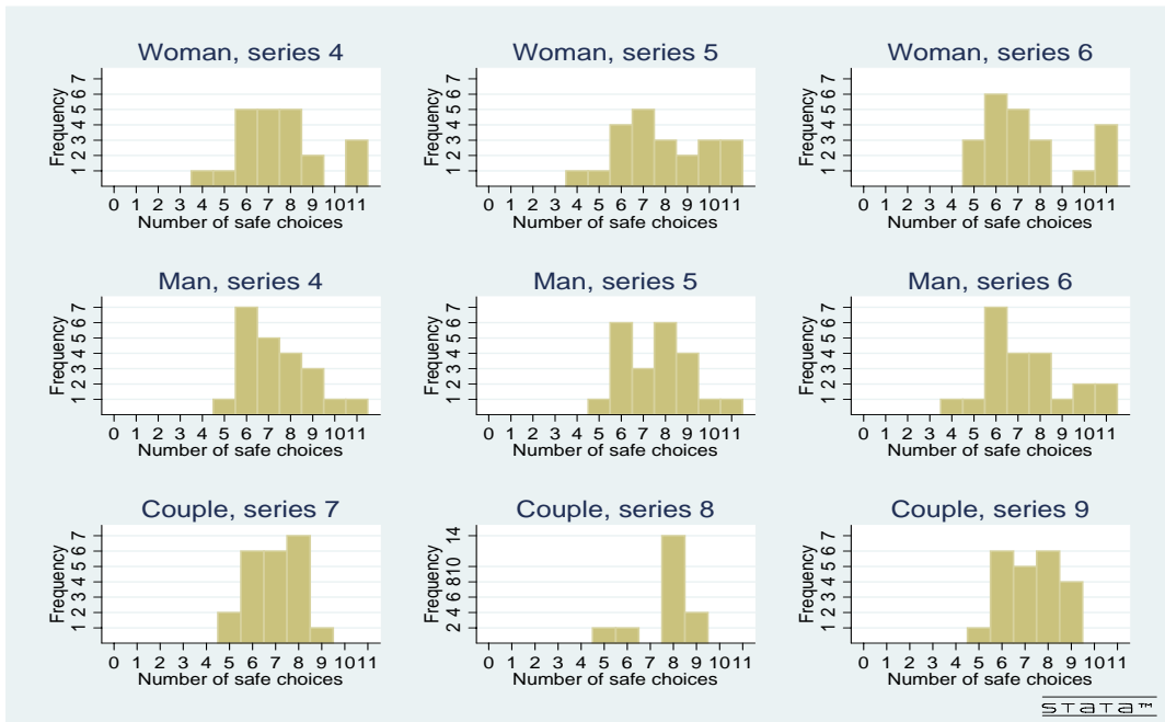
Figure 2: Empirical distributions of safe choices, couple money.

series, the distribution of couple choices is more concentrated than the distribution of spouse choices.