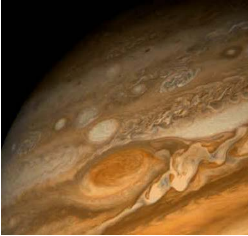
Fig. 4. The surface of Jupiter clearly shows the presence of turbulent motions (including the great red spot) that can be noisy enough, in the real acoustic sense of the word, to imply the presence of resonant acoustic vibrations of all the planet body.

two important space projects will be partly devoted to it. The French Corot instrument (Baglin et al. 1998) is supposed to fly within the next two or three years, while the more ambitious Eddington European project is in the ESA package for 2008/2013 (Favata et al. 2000). These space missions intend to measure as many stars as possible, so that they will avoid the brightest of them for the simple reason that they are too bright and an instrument cannot be tuned for both bright and faint stars. As generally speaking, the brightest stars are also our nearest neighbors, they are extremely interesting, and they represent an ideal target for the dome C ground based site, provided the scintillation level confirms that it is indeed significantly lower than anywhere else. Alpha Centauri will be measured during the first accessible night, in 2005.