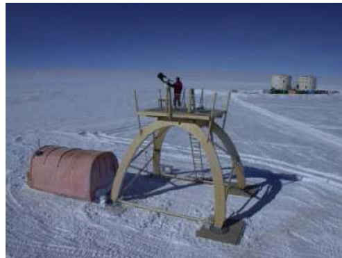
Fig. 3. This wooden platform is the first of two that will support, at 6m above the ice surface, the series of small telescopes of the Concordiastro programme, making site testing on one of them and astroseismology on the other one.

Another important parameter of the site qualification is the cloud cover statistics, that is not outstanding at South Pole, the sky being covered by more or less thin cirrus clouds nearly 50 percent of time. The precise statistics is not known yet at dome C, but it begins to appear that it will be much better, and even possibly outstanding. The Aastino (Lawrence 2003) and Icecam Australian programmes (Travouillon 2003) are now measuring it at night. Of course, if the seeing night time is really exceptional thanks to the slow winds, with an outstanding cloud cover statistics, the site can then be regarded as the best in