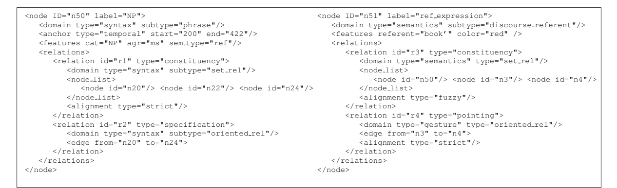
Figure 4: XML encoding of hypernodes

(n50). In this expression, the alignment between the objects is fuzzy, which is the normal situation when different modalities interact. The second relation describes the pointing action, implementing the coreference between the noun phrase and the physical object. This representation indicates the three nodes as constituents.