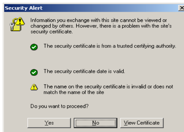
figure 3 : Window Security Alert

The theft can be unmasked if the voter verifies that the security certificate is known and valid. But a falsified safety certificate may have been accepted on the same computer during a previous connection to a web site thought to be secure, causing the display of a warning (see Figure 3). In this case, many users choose to continue, without being aware that they allow a potentially falsified safety certificate to join safety certificates that have been duly approved by certification authorities. Thus, when connecting to the fake voting web site, there will be no security alert.