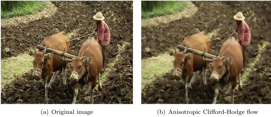
FIG. 4.1. Clifford-Hodge flow of functions

Fig. 4.1 is an illustration of the anisotropic regularization of a color image ( n = 3 ) induced by the Clifford-Hodge flow. It is computed from the convolution with a 5 \times 5 mask discretizing the kernel K_t^0 . Fig. 4.1(a) is taken from the Berkeley image segmentation database [12]. Fig. 4.1(b) is the result of the regularization after 10 iterations for h_1 = h_2 = h_3 = 0.01 and t = 0.3 , the metric g being updated at each iteration. We obtain a smoothing of the image on regions of low color variations whereas high edges are preserved.