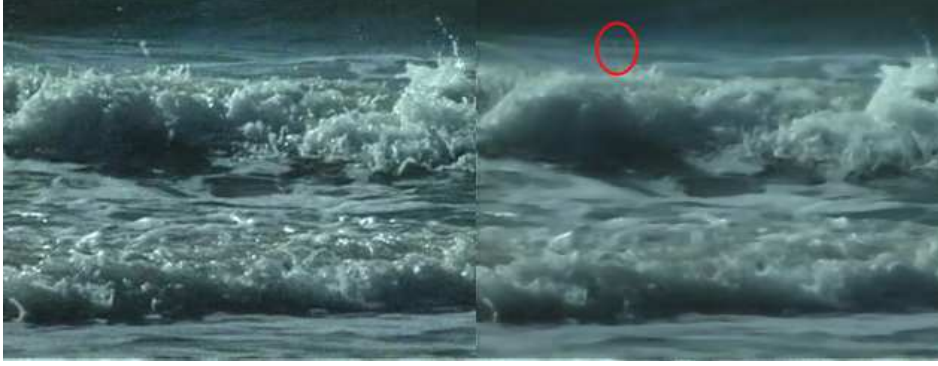
(a) Original video (left) / Anisotropic Clifford-Hodge flow (right) for \beta = 1