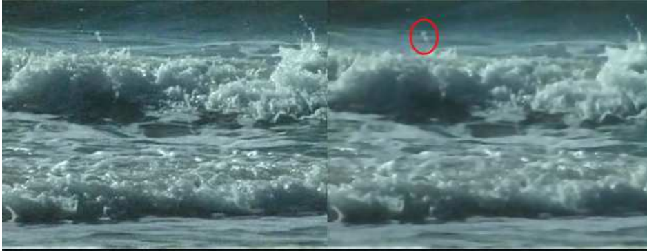
(b) Original video (left) / Anisotropic Clifford-Hodge flow (right) for \beta = 10