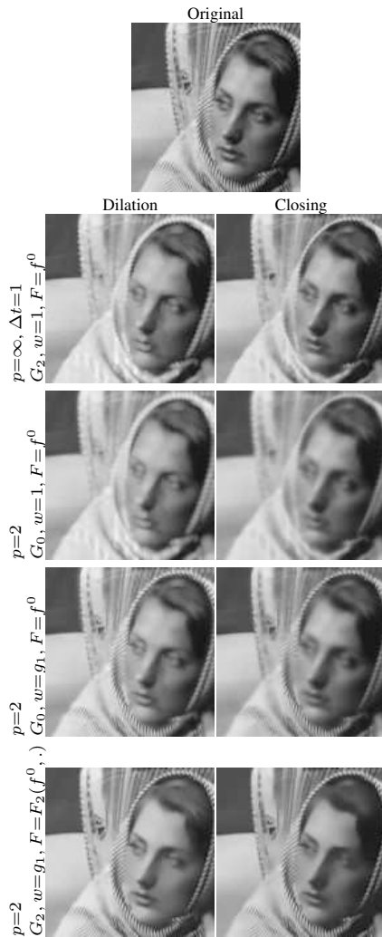
Figure 1: Morphological Image Processing with graphs (see text for details).

databases can be used as pre-processing steps for data mining purposes.