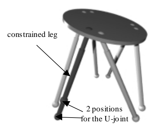
Figure 3: Two different robots with the same orientation of one leg for a given configuration q

The QR decomposition of W shows that using only one sensor reading is sufficient to identify 30 parameters which is the maximum for a self calibration method. In this case, the condition number of W is about 1500. This means that the increase of the number of measured angles increases the observability of the system, using 6 sensors on 3 passive U-joint gives reduces the condition number to about 350.